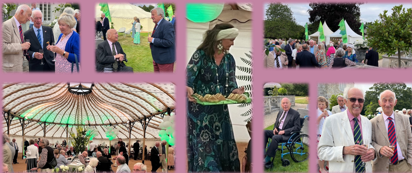
President's Evening - 4th July, 2024

The trip on the Waverley Paddle Steamer takes place on 2nd September and forty-two intrepid members have booked for the event. We wish them a calm sea and prosperous voyage. (Hands up all those who recognise that quote as the title of a work by Mendelssohn, quoted in Elgar's Enigma Variations!)