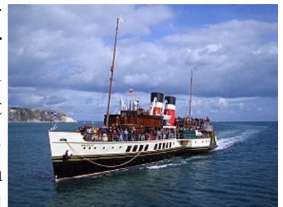
PS Waverley off Swanage

PS Waverley is named after Sir Walter Scott's first novel. She was built for the London and North Eastern Railway (LNER) to replace a PS Waverley that was sunk in 1940 while helping to evacuate troops from Dunkirk and is the last surviving seagoing passenger carrying paddle steamer in the world. Bought by the Paddle Steamer Preservation Society (PSPS), she has been restored to her 1947 appearance and now operates passenger excursions around the British coast and often operates cruises off the Dorset coast (see photo). She has a tonnage of 693 gross registered tons, is 239 ft 11 in (73.13 m) in length, has a beam of 57 ft 3 in (17.45 m) and a draught of 6 ft 3 in (1.91 m). She is registered to carry 925 passengers.